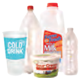
Plastic Bottles, Cups & Containers