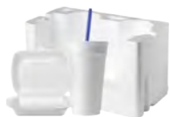
Foam Cups & Containers