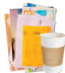
Paper & Paper Cups